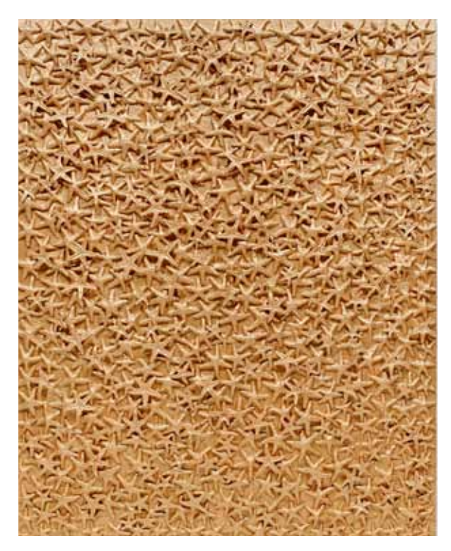
Nabil Nahas - Untitled" 1994. Echinoderms and Acrylic on canvas. 153x122cm

Looking to thicken the paint and further explore texture, another breakthrough work came in 1997, entitled Silver Wind. Here for the first time Nahas mixed ground pumice with acrylic, building up a thick encrusted surface in psychedelic colours. This set the tone for the next few years. Working across a variety of sizes these paintings are of different scales and moods. The smallest of these, with their roughness of texture and tightly packed irregular forms, are like windows into the underwater world of coral reefs, the surface resembling clusters of mussels or coral reef, the bright colours recalling the dappled light of tropic waters. Quite different are larger paintings, which overpower the viewer like the encrusted surface of a leviathan.